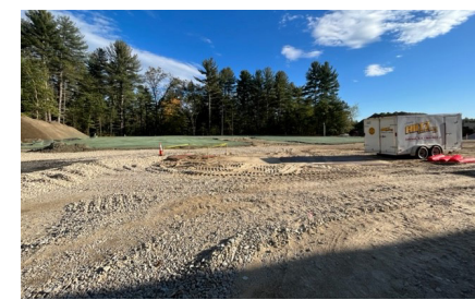
Above: Septic fields loamed and seeded.