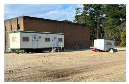
Above: Office trailer.