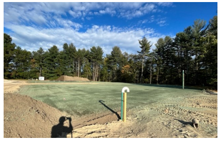
Above: Septic fields loamed and seeded.